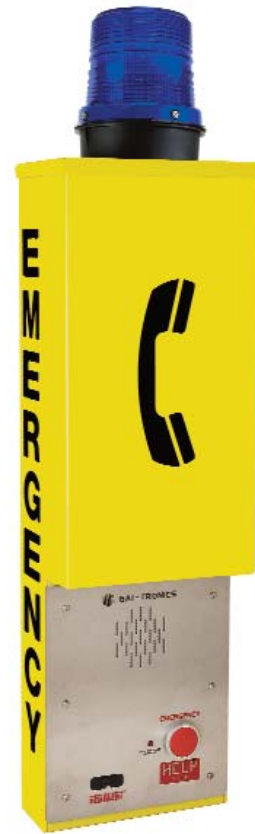
Model 240WM-001 Yellow Wall-mount Communication Station w/ LED Strobe and Panel Light