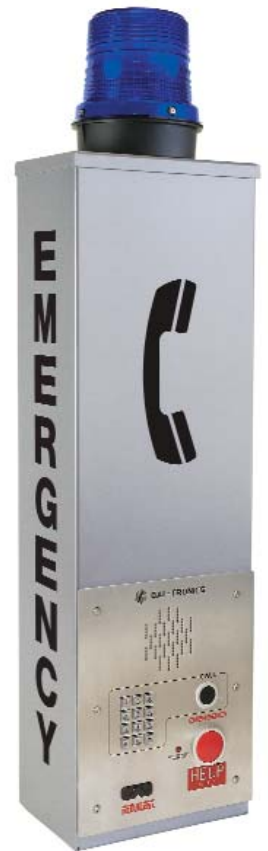
Model 241WM-002 Silver Wall-mount Communication Station w/ LED Strobe

GAI-Tronics 24x Series Wall-mount Communication Station provide a budget-friendly, aesthetically appealing emergency communications package for indoor or outdoor use. Both Model 240WM-00x and 241WM-00x series wall-mount communication stations include an integral blue, LED strobe that offers a constant-on feature for easy location of the emergency telephone. The strobe flashes when an emergency call is initiated and remains in that state until the call is terminated. The Model 240WM-00x additionally includes an integral recessed panel light for telephone panel illumination in dimly-lit areas.