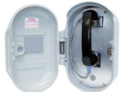
277-001 Tough Phone

GAI-Tronics® wide variety of indoor and outdoor Industrial Telephones are designed for those applications where standard telephones are not environmentally suitable. Such applications include public areas, plant entrances, college campuses, airports, commercial locations, parking garages and amusement parks.