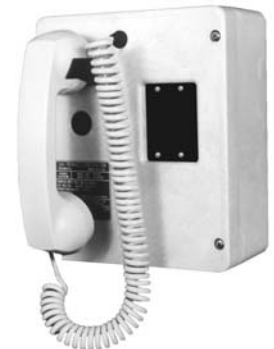
247-001 Indoor Phone