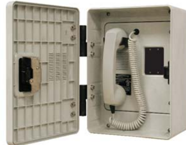
257-001 Outdoor Phone